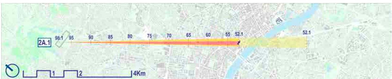
Annotated map of Protected Vista from Assessment Point 2A.1 to St Paul's Cathedral