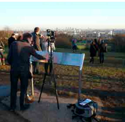
View from Assessment Point 2A.1 Parliament Hill: the summit - looking toward St Paul's Cathedral (at the orientation board). 527665.4E 186131.5N. Camera height 98.10m AOD. Aiming at St Paul's Cathedral (Central axis of the dome, at the base of the drum). Bearing 138.7°, distance 6.6km.