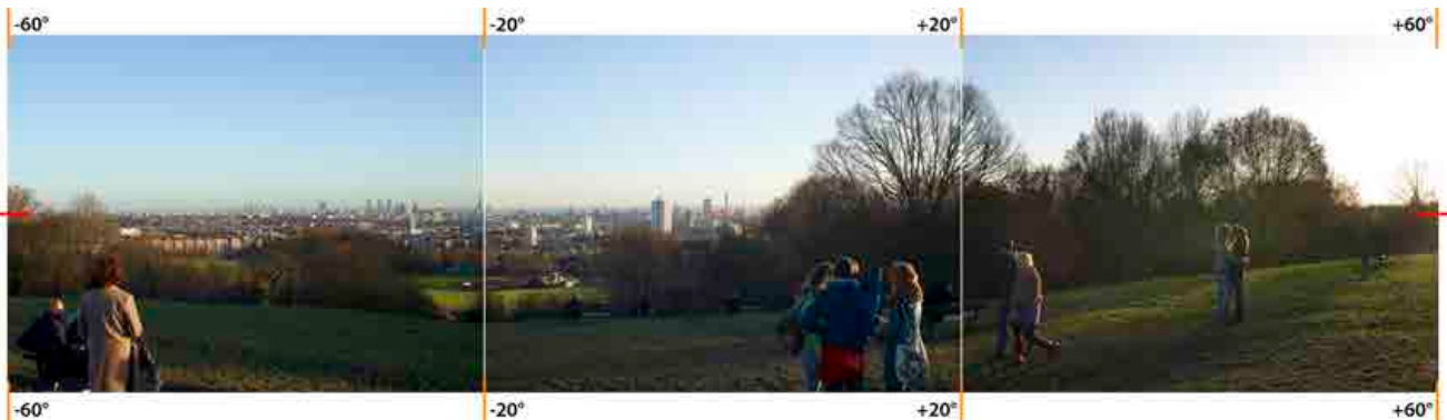
Panorama from Assessment Point 2A.2 Parliament Hill: the summit - looking toward the Palace of Westminster