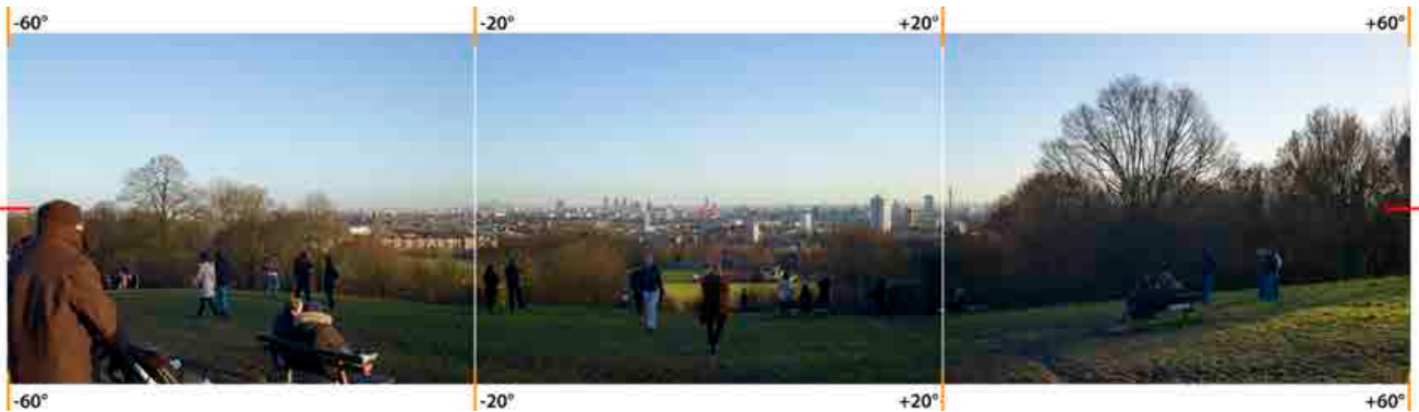
Panorama from Assessment Point 2A.1 Parliament Hill: the summit - looking toward St Paul's Cathedral